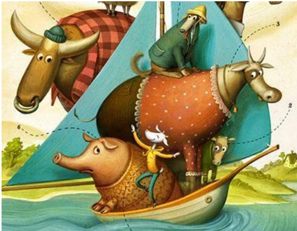
Figure 2. “Marta’s Gift”, I. Sulima

Both approaches have their advantages and disadvantages, so most contemporary illustrators choose to combine traditional and digital techniques to maximise their benefits and minimise their drawbacks. Disadvantages of hand-drawn illustrations include limited editing capabilities and potential difficulties in reproducing quality and colours in print (Zhang and Chubotina, 2024). Meanwhile, digital works by different artists sometimes look similar due to the use of a standardised set of templates, brushes, textures, and automated functions in graphic editors.