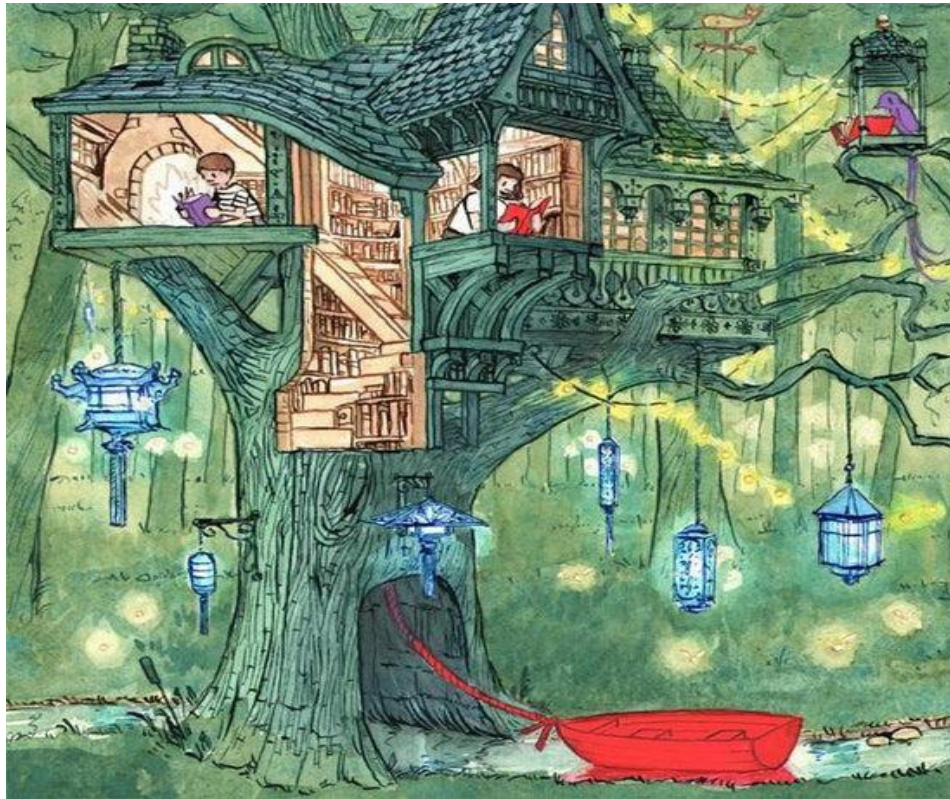
Figure 3. “Journey”, A. Becker (Source: A. Becker (2013))

Another current approach to visualising text is the wimmelbook style. Originating from Germany, this style is characterised by detailed, drawn scenes where objects, characters, and their activities are the focus. A defining feature of the wimmelbook style is not a focus on a single scene, but rather a collection of different storylines within a single composition (Lytvyn et al., 2018). Stories that unfold simultaneously on one page allow readers to wander from corner to corner of the image, developing children’s attention and interest in reading. Filling the space with dense detail captivates readers, stimulating them to learn new things. This style can be considered a playful experiment in book illustration, conducted to immerse readers in the plot and idea of the work.