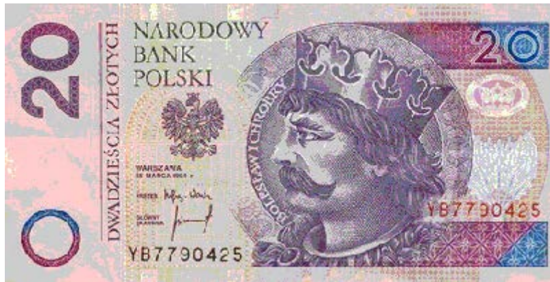
20 polish zlotys