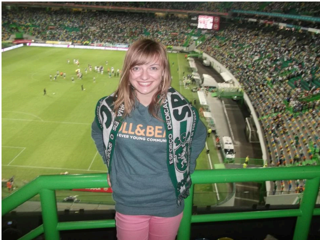
I really like football that's why i had to go to the stadium in Portugal. It is me in Lisbon during the Sporting's match in Estádio José De Alvalade ☺

In recent years ski jumping gained in importance thanks to the success of Adam Malysz, Formula 1 because of Robert Kubica, handball because of the success of the Polish national team for the two World Championships in 2007 and 2009, as well as swimming through successes such as Otylia Jędrzejczak and Paweł Korzeniowski.